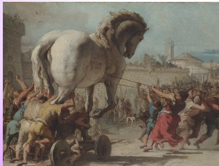
Depiction of The Trojan Horse