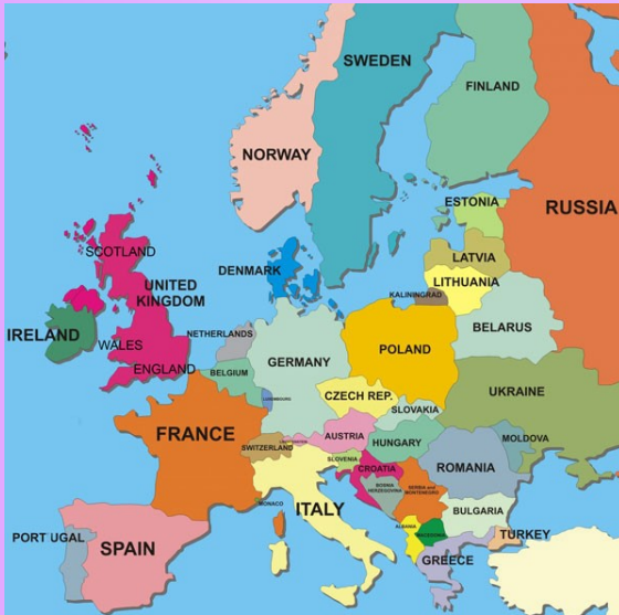
Map of Europe Showing Greece