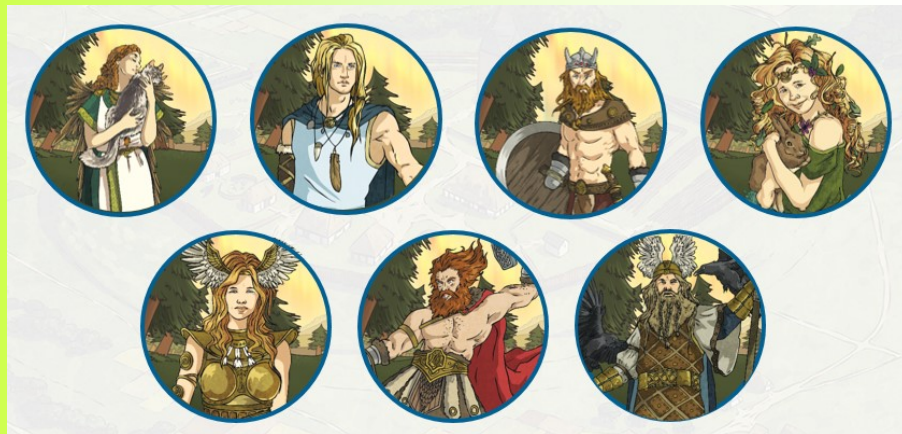
Anglo Saxon Gods