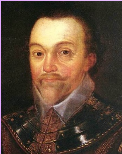
Sir Francis Drake