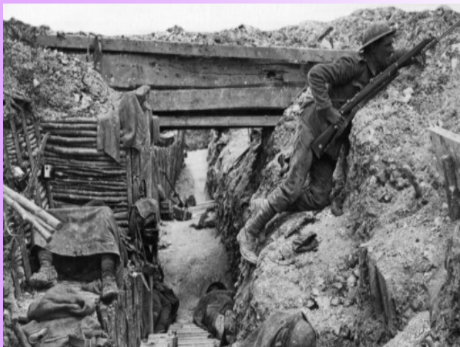
A soldier in the trenches during the First World War